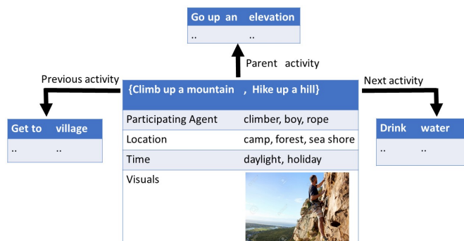
Figure 1: Activity Frame Example

and thus canonicalized with regard to high-quality linguistic resources like WordNet or VerbNet [36, 18].